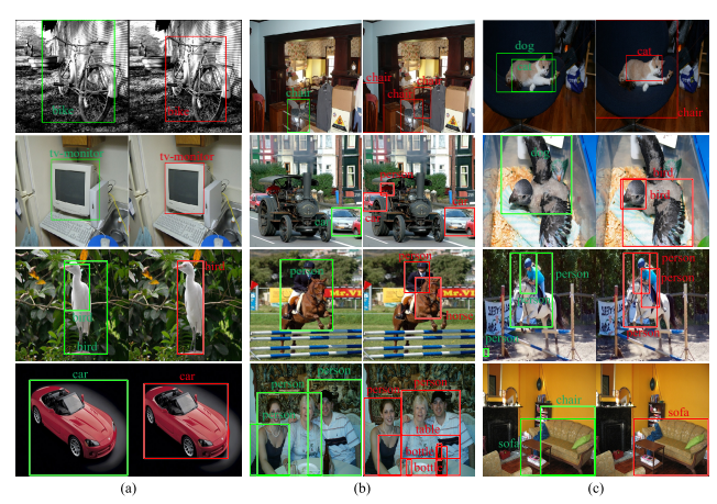
Figure 2. Detection examples from PASCAL VOC 2007 dataset. The boxes and category labels obtained by baseline FRCN is in green, and those obtained by the proposed structure model is in red.

Fig. 2 demonstrates some object detection examples obtained by the proposed method and FRCN. Thanks to the use of reconstruction residual in both objectness estimation and categoryness calculation, the selected bounding box with optimal detection score by our method has fewer background, as shown in Fig. 2 (a). When one bounding box covers more background, its reconstruction residual over the objectness dictionary pairs will be larger, resulting in a lower detection score. Thanks to the divide-and-conquer manner brought by ODP and CDP, our model can recognize