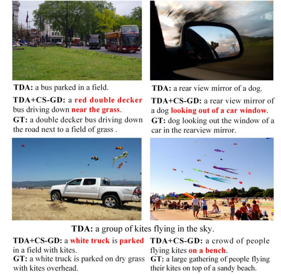
with kites overhead. their kites on top of a sandy beach. Fig. 3. Captions generated by the TDA baseline and Our TDA+CS-GD.

upon the 5,000 test images, the ST baseline can merely generate 2,713 different sentences, and our method can increase the number to 3,140, a relative increase of 15.7%. A similar phenomenon can be observed if using the TDA baseline. Note that the two baselines are different, and we can achieve consistent improvement on both baselines, suggesting that our proposed objective is capable of adapting to various caption models.