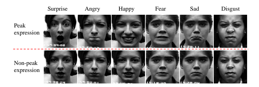
Fig. 1. Examples of six facial expression samples, including surprise, angry, happy, fear, sad and disgust. For each subject, the peak and non-peak expressions are shown.

significant recent progress [10,11,4,12], FER is still a challenging problem, due to the following difficulties. First, as illustrated in Fig. 1, different subjects often dsiplay the same expression with diverse intensities and visual appearances. In a videostream, an expression will first appear in a subtle form and then grow into a strong display of the underlying feelings. We refer to the former as a non-peak and to the latter as a peak expression. Second, peak and non-peak expressions by the same subject can have significant variation in terms of attributes such as mouth corner radian, facial wrinkles, etc. Third, non-peak expressions are more commonly displayed than peak expressions. It is usually difficult to capture critical and subtle expression details from non-peak expression images, which can be hard to distinguish across expressions. For example, the non-peak expressions for fear and sadness are quite similar in Fig. 1.